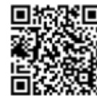
Online Assessment Form (Immigration)